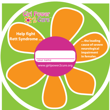
$1 paper icon sales

* We would love to have the flowers "blooming" in April/May, but any time of year is fine!